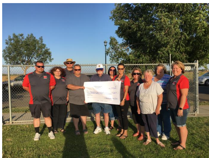
We gave a donation of $3,000.00 to the Chowchilla Youth Football to buy new helmets, pads and other equipment that they have been needing. They were extremely grateful for our donation to their program!